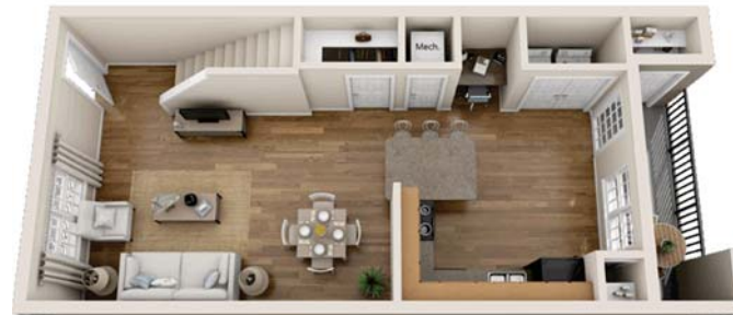
B3 2Bdrm/2Bath Townhouse 1,000 Sq. Ft.*