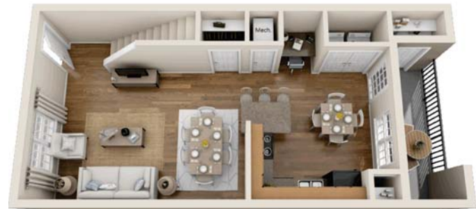
C3 3Bdrm/2Bath Townhouse 1,224 Sq. Ft.*