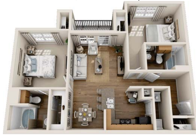
B1 2Bdrm/2Bath 950 Sq. Ft.*