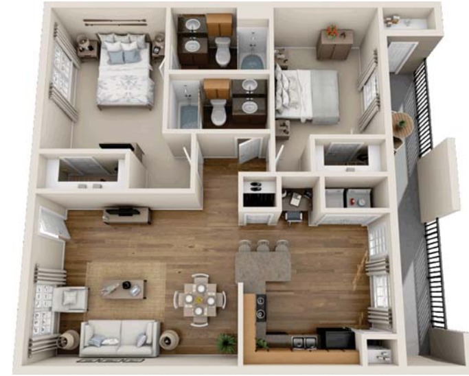
B2 2Bdrm/2Bath 1,000 Sq. Ft.*