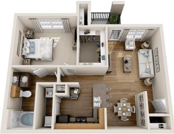
A1 1Bdrm/1Bath 750 Sq. Ft.*